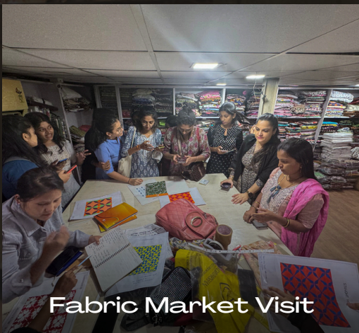
Fabric Market Visit