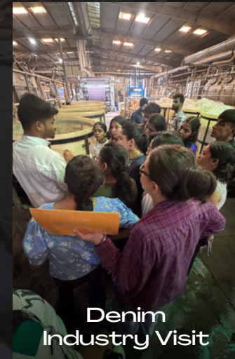
Denim Industry Visit