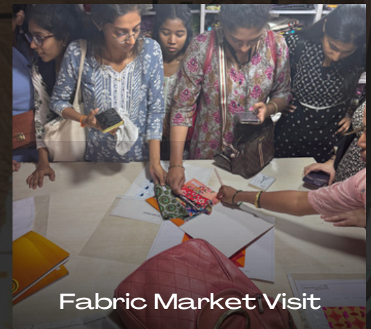
Fabric Market Visit