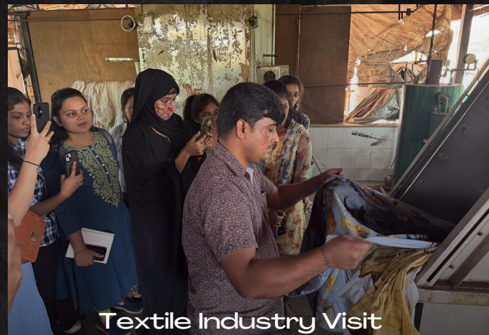
Textile Industry Visit