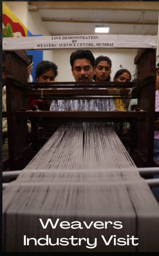
Weavers Industry Visit