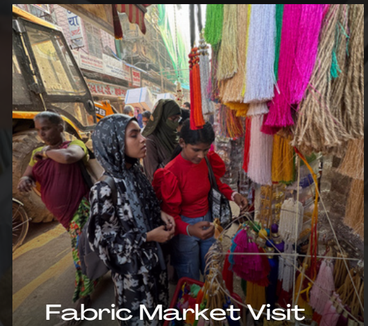
Fabric Market Visit