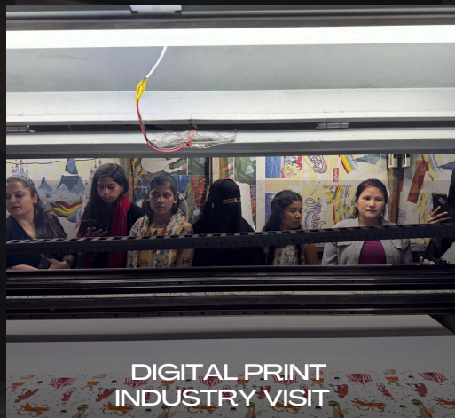
DIGITAL PRINT INDUSTRY VISIT