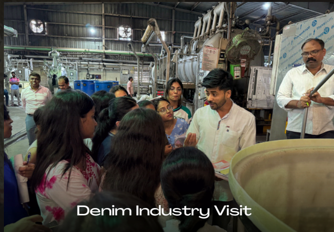
Denim Industry Visit