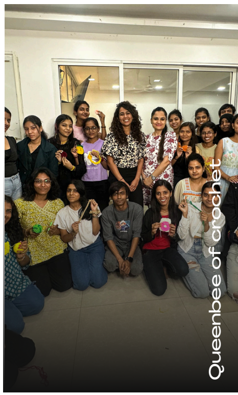
Queenbee of crochet